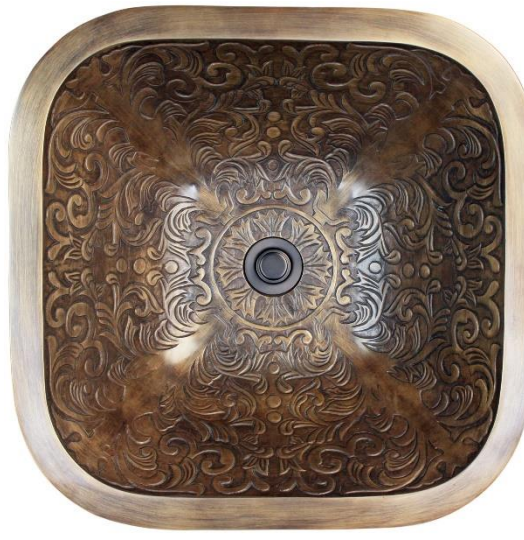
Shown in AB